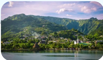
DAY 8: PAPEETE