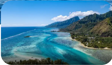
DAY 2: MOOREA