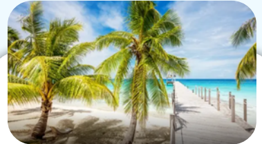
DAY 7: HUAHINE