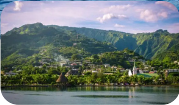
DAY 1: PAPEETE