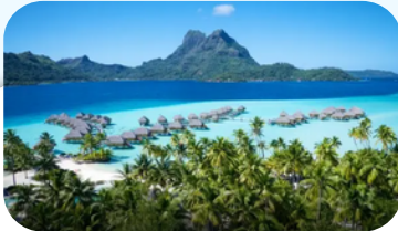
DAY 5-6: BORA BORA