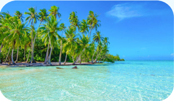
DAY 4: RAIATEA & TAHAA