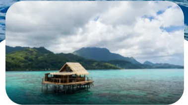
DAY 3: RAIATEA